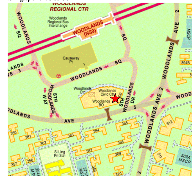
Reproduced with permission of SLA.

North West CDC Woodlands Civic Centre 6 th floor, 900 South Woodlands Drive Singapore 730900